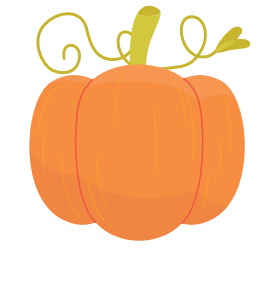
Big Jim's Farms Intergenerational Trip

October 6, 2022 9:30 am- 11:30 am Free Admission Pay for what you pick Educational Class $8