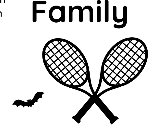
Family Tennis Every Saturday in October Half Court Gym 11:15 am- 2:15 pm